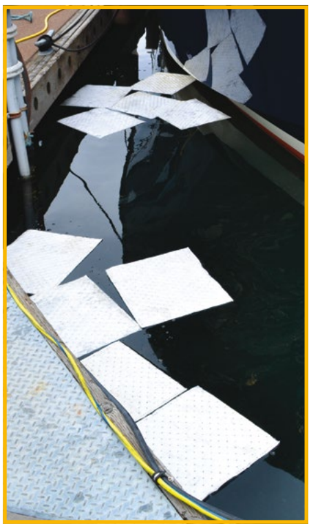
OIL-ONLY SORBENT PADS

Spill Kits Buffalo's Spill Kits solve your needs for immediate, reliable and portable spill containment. Each kit is available with oil-only (white) or universal (gray) polypropylene sorbents. Kits contain everything you need for quick and effective response to an oil or chemical spill. Please refer to the "Fast Facts About Sorbents" chart on page 17 for further evaluation chorts and chart on page 17 for further explanation about sorbents and their characteristics.