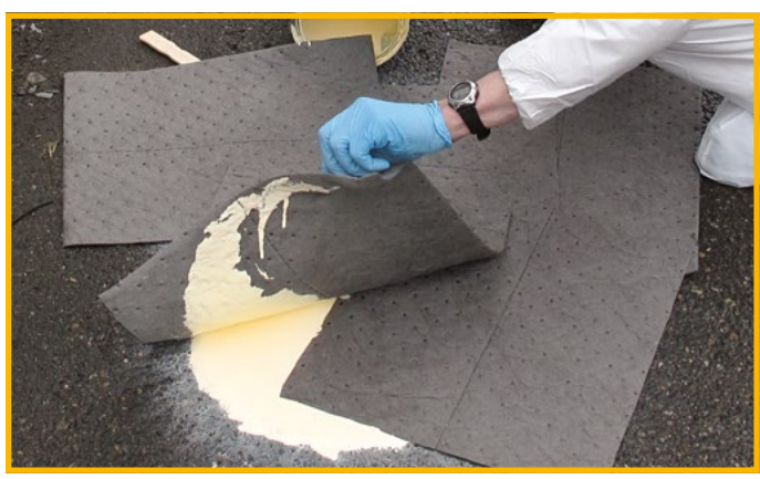
UNIVERSAL SORBENT PADS