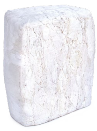
50 POUND COMPRESSED POLY BAG