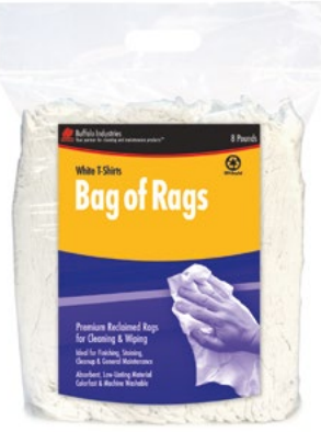
8 POUND COMPRESSED POLY BAG