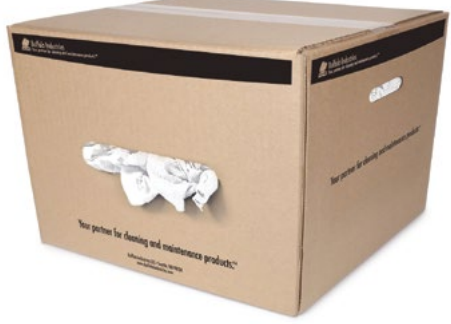
25 POUND BOX