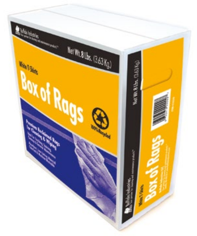
8 POUND BOX