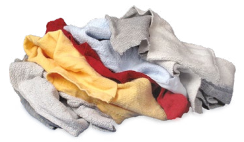
RECYCLED COLORED SWEATSHIRTS