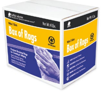
4 POUND BOX

Recycled White T-Shirts are shown here as representative examples. Packages are not shown to scale or relative size.