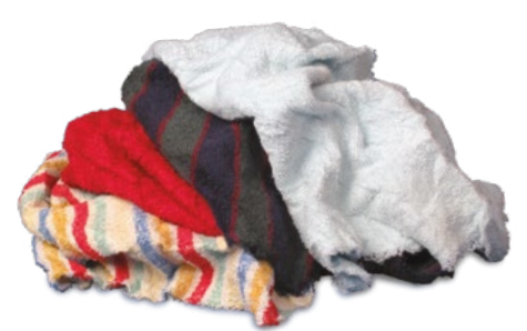
RECYCLED COLORED TURKISH TOWELING

We also offer many colored wipers not listed. Please inquire for more information. BUFFALO INDUSTRIES • TOLL-FREE: 800-683-0052