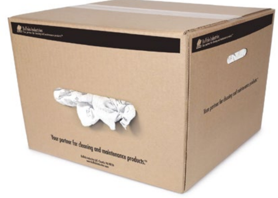
50 POUND BOX