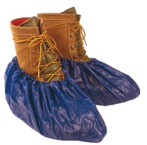
XL WATERPROOF SHOE & BOOT COVERS