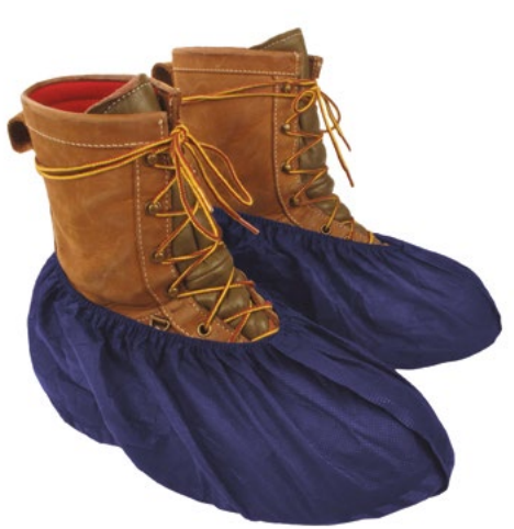
XL ECONOMY SHOE & BOOT COVERS

Heavy-duty water barrier in flooded situations. Durable, textured, plastic material. Low-profile, extra large size to fit over size 18 work boots. Elastic top and bottom for a secure fit.